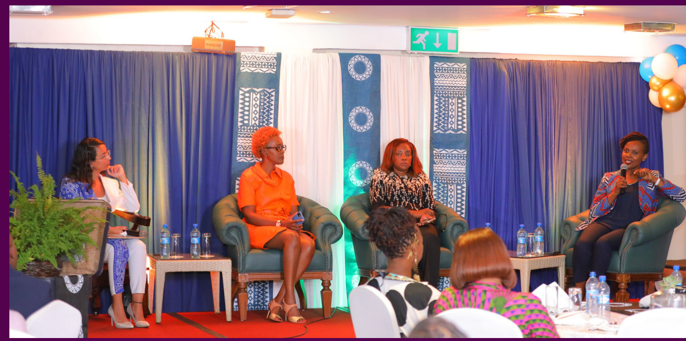
Panel discussion on technology and the opportunities it presents women in manufacturing

On 30th March 2023, KAM hosted the 5th Women in Manufacturing (WIM) Gala Dinner, themed Leveraging on technology to enhance productivity and sustainability for women in manufacturing.