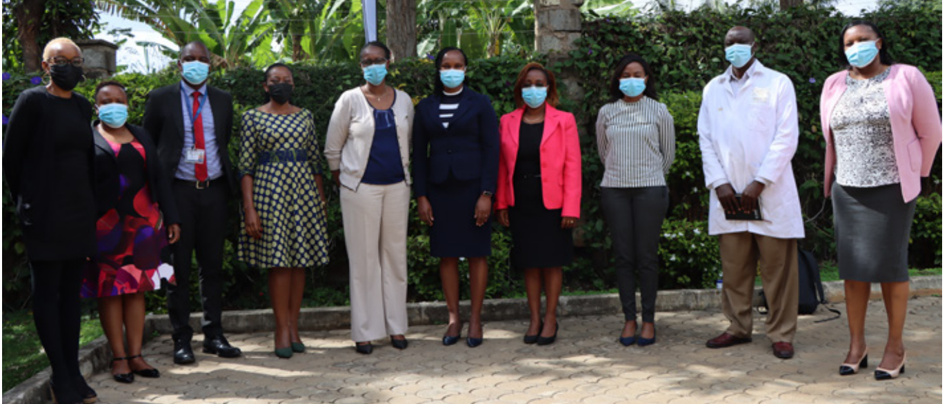
Visit to HACO Industries on subcontracting opportunities for local industries