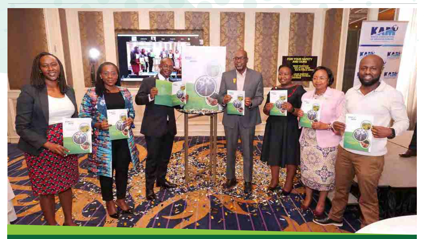
Launch of the Forestry Business Sustainable Action Plan.

The reports and profiles aim at informing proindustry policy formation in the country. During the launches, the Association called for sectorspecific approach to resolve the challenges hampering the growth of the manufacturing sector. The challenges include inadequate guidance on Buy Kenya Build Kenya; regulatory overreach; unfavourable tax regime; prolonged delays in the review of EAC Common External Tariff (CET); reliance on imported raw materials; lack of access or the high cost of credit and illicit trade.