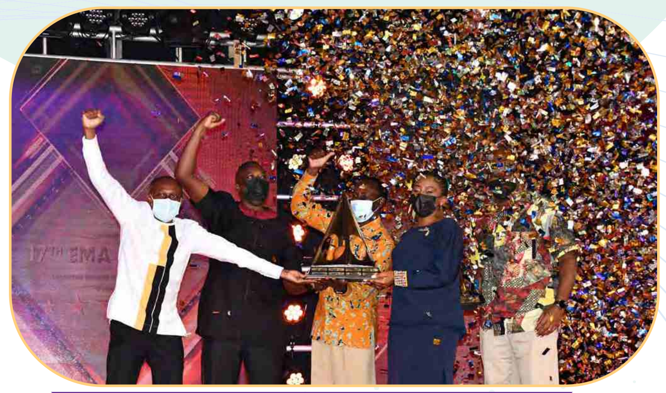
BAT Nairobi celebrates after emerging the overall winner at the 17th Annual Energy Management Awards