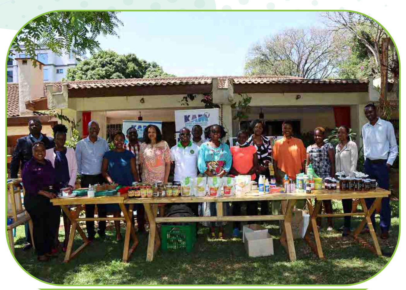
SME Study tour to Funkidz/ Funhomes to benchmark on best practices in circular economy.

The SME Hub conducted various study tours where manufacturing SMEs were taken through subcontracting opportunities, circular economy and incubation services and start up support. Among the companies visited include Konza Technopolis, Haco Industries, BOC Kenya, Aromakare, Tropikal Brands, Bio Foods and FunKidz / FunHomes.