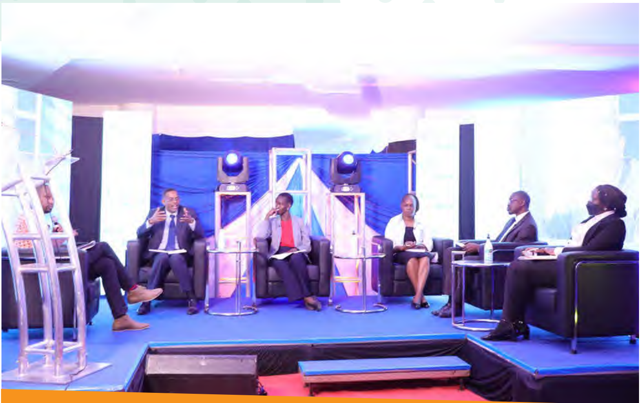
Panel session during the SME bootcamp on regulatory overreach.

During the launch, manufacturers urged the government to harmonize laws, policies, and regulations, at the National and County levels, to drive the competitiveness of local industry.