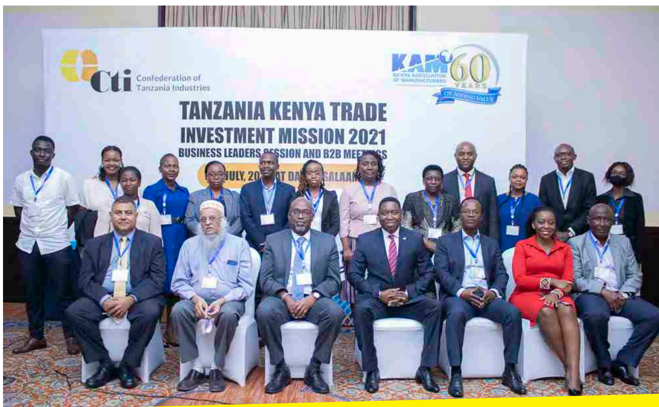
Participants during the Tanzania Trade Mission.

The committee constituted representatives from the Ministry of Industrialization, Trade and Enterprises Development, Ministry of Petroleum and Mining, The National Treasury, Kenya Bureau of Standards (KEBS), a representative from the grinders, clinker manufacturers and KAM.