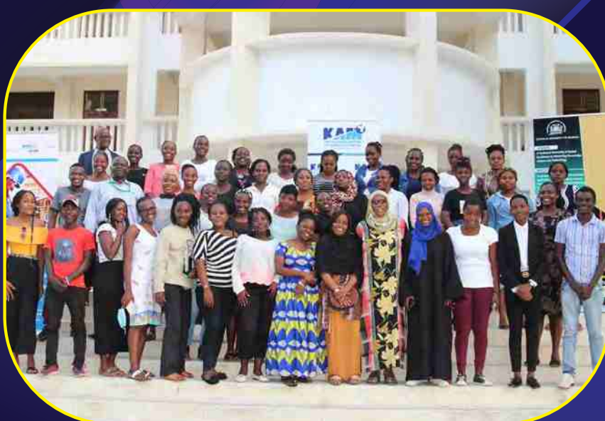
TVET Mentorship Session at Technical University of Mombasa.

Through the partnership, KAM and ILO shall provide training opportunities to young people in refugee camps and the surrounding host communities, to increase their employability in local industries. The partnership targets Technical and Vocational Education and Training (TVET) students in Turkana and Garissa Counties.