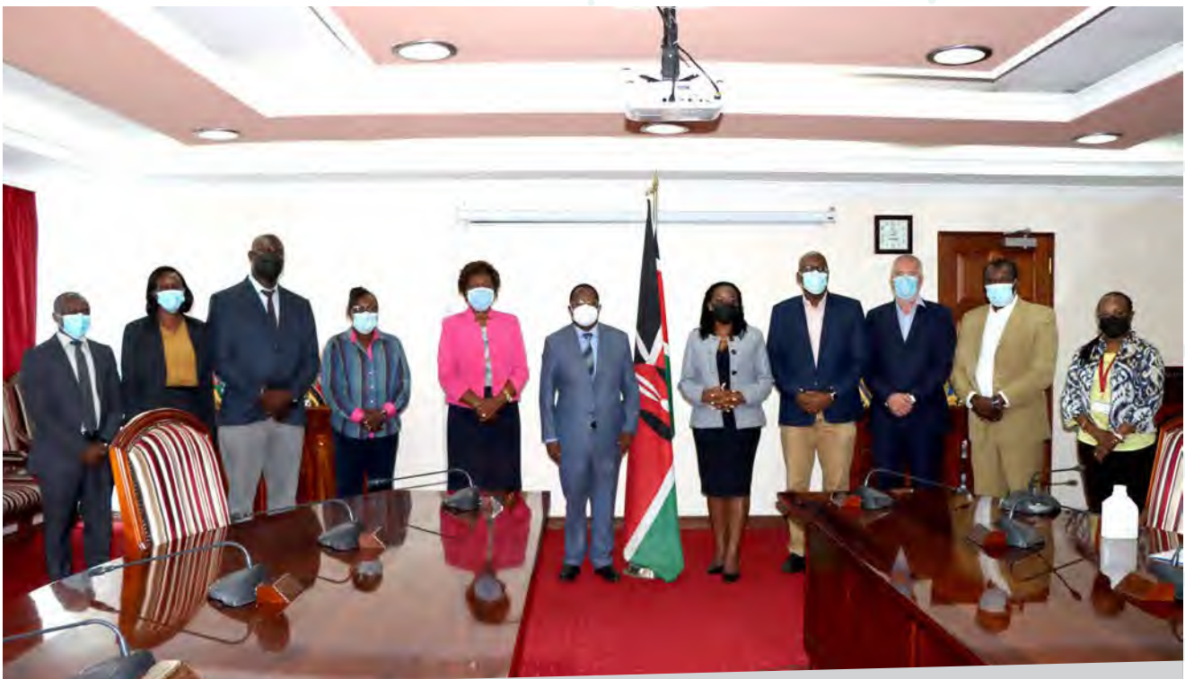
KAM engages the Council of Governors on trading in the counties.

A key outcome of the meeting was the nomination of two liaison officers from KPA to fast-track manufacturers' consignments and provide updates on vessels' arrival and container movements at the ports, as part of deliberate efforts to enhance the seamless and speedy movement of cargo at Port.