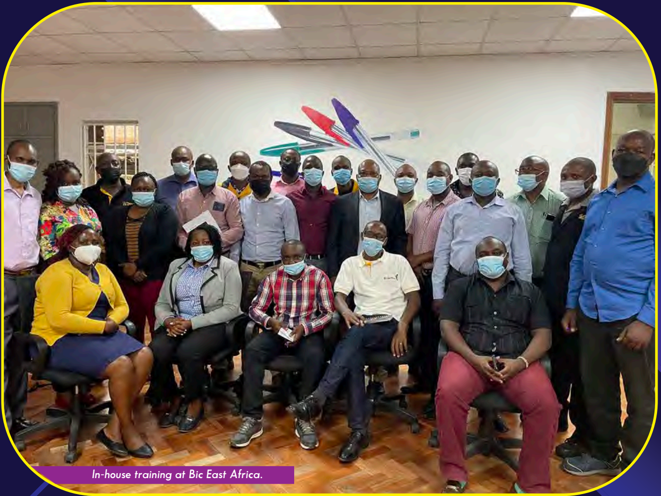
In-house training at Bic East Africa.