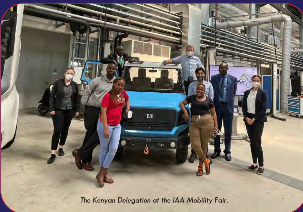
The Kenyan Delegation at the IAA Mobility Fair.