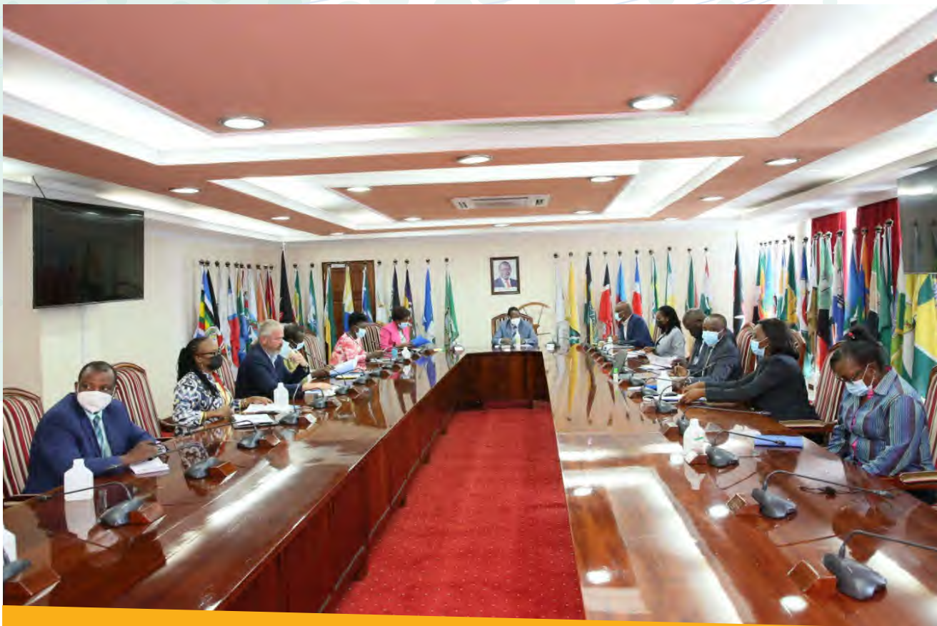
KAM meets Council of Governors on the Manufacturing Priority Agenda, 2021.

This year's Manufacturing Priority Agenda (MPA), themed " From surviving COVID-19 to thriving: Manufacturing sector rebound for sustained job and investment growth " called for immediate action to bolster economic recovery following the pandemic.