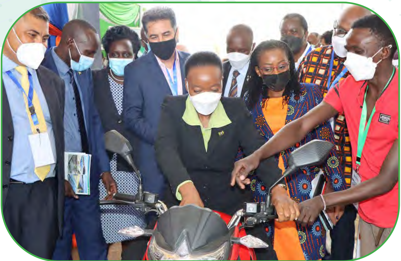
Energy CS, Amb. Monica Juma, tests a solar-powered motorcycle during the Clean Energy Conference and CEO Forum

We hosted the 7th Clean Energy Conference & CEO's Forum under the theme, Resilience of clean energy markets during uncertain times , during the Changamka Shopping Festival.