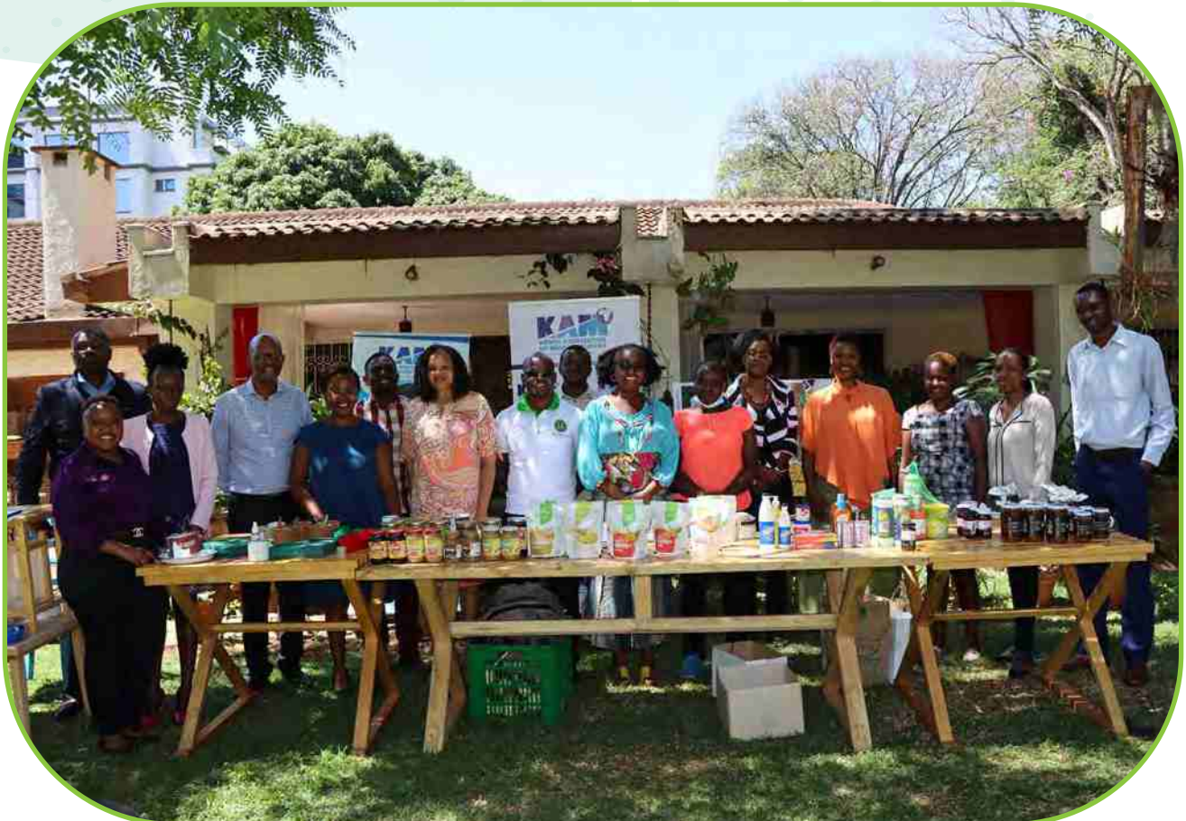
SME Study tour to Funkidz/ Funhomes to benchmark on best practices in circular economy.

The SME Hub conducted various study tours where manufacturing SMEs were taken through subcontracting opportunities, circular economy and incubation services and start up support. Among the companies visited include Konza Technopolis, Haco Industries, BOC Kenya, Aromakare, Tropikal Brands, Bio Foods and FunKidz / FunHomes.