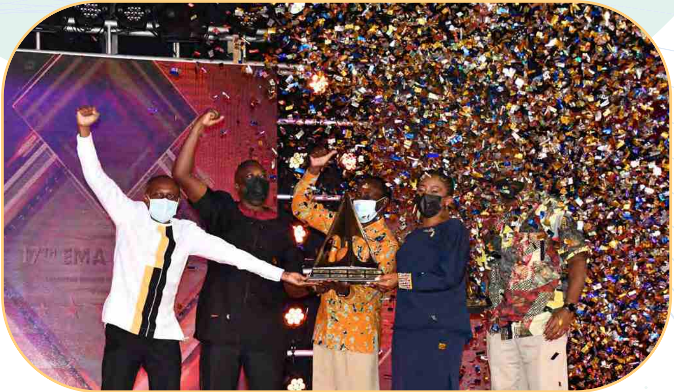
BAT Nairobi celebrates after emerging the overall winner at the 17th Annual Energy Management Awards