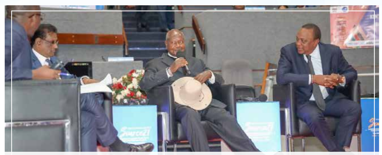
H.E. Paramasivum Pillay Vyapoory, President, Republic of Mauritius, H.E Yoweri Museveni, President of the Republic of Uganda, H.E. Hon. Uhuru Kenyatta, President of the Republic of Kenya and Commander-in-Chief of the Defence Forces during a presidential panel session at Source 21 COMESA Business Summit