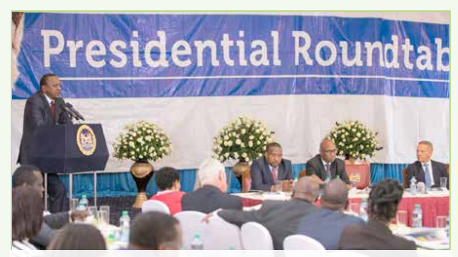
H.E President Uhuru Kenyatta addresses industry representatives and other stakeholders during 10th Presidential Roundtable

He was in agreement with the private sector's proposal that late payments either, Government to Business or Business to Business, should be fast-tracked and cleared in a maximum of 60days payment cycle. As a result of this discussion, the government empowered the Competition Authority of Kenya to address unfair payment practices.