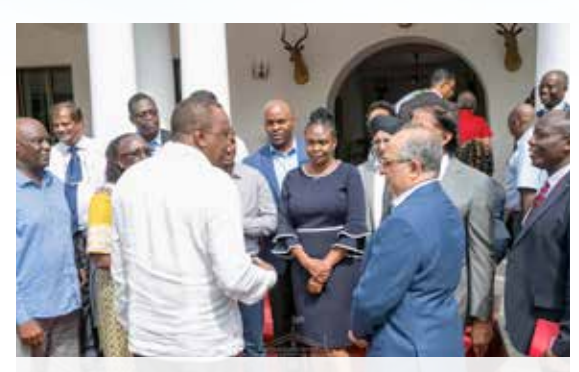
H.E. President Uhuru Kenyatta engages Automotive sector

KAM engaged the State Department of Investment and Industry representatives to discuss and adopt the motorcycle regulations. The regulations were agreed upon and adopted by the Ministry and signed off by all motorcycle assemblers present.